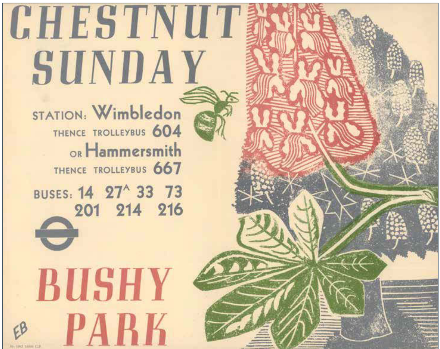
Chestnut Sunday; Bushy Park, by Edward Bawden, 1936