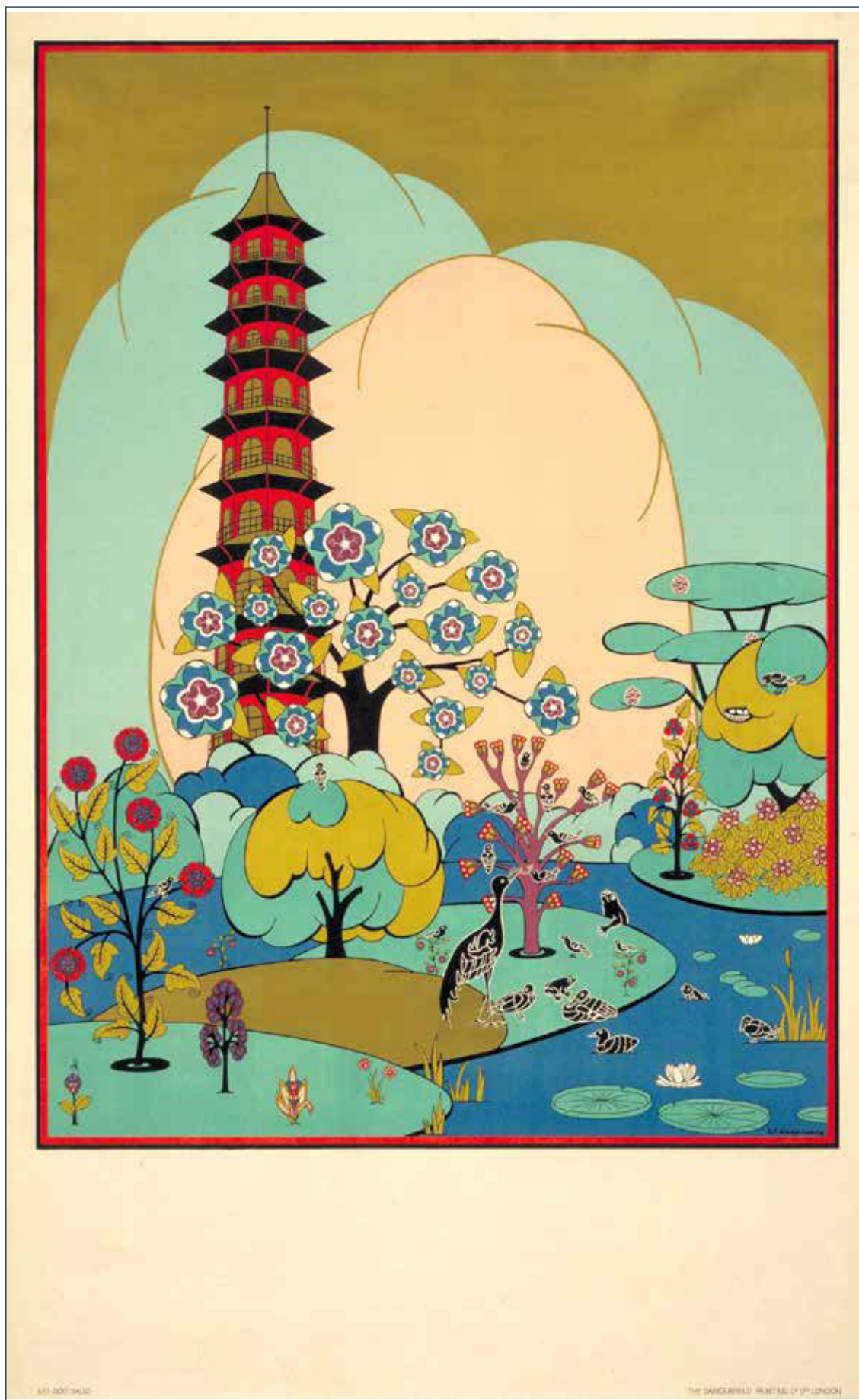
Kew Gardens, by W Langlands, 1932