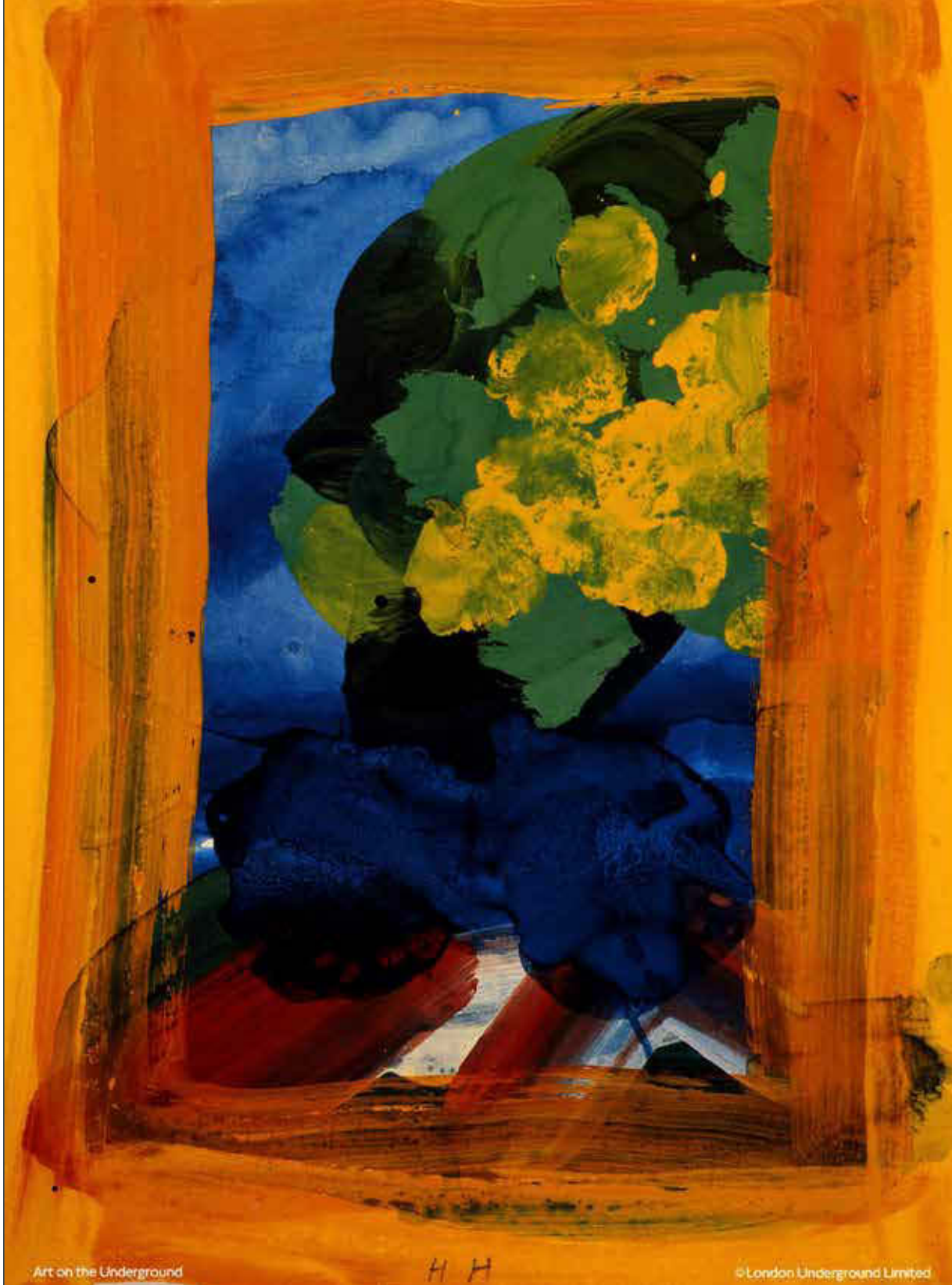
Highgate Ponds, by Howard Hodgkin, 1989

Highgate Ponds by Howard Hodgkin A new work of art commissioned by London Underground