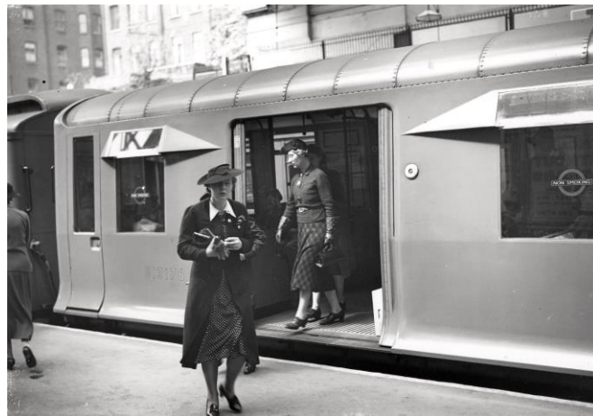
Q38 stock at Earls Court, 1939